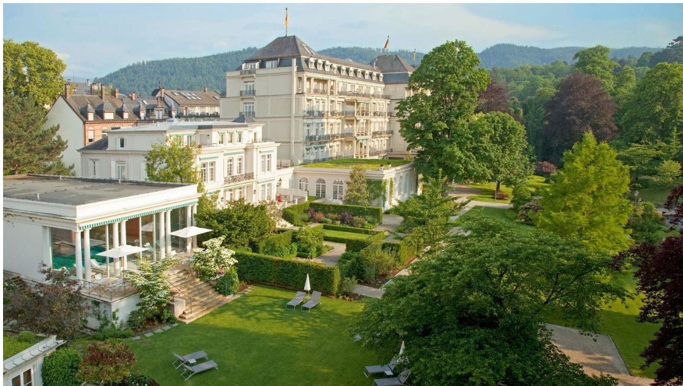
Overnight 5 Star Brenners Park Hotel

Depart from home for your overnight flight to Frankfurt, Germany. Fast Lane Travel, Inc. will be happy to assist you with booking your flights. If possible, please arrive a day early (i.e., you leave the USA on Sunday, May 13 th and arrive Monday, May 14 th ) to have some time to relax in Germany before the tour starts, adjust to the time change, and enjoy our early arrival dinner with the group! Tomorrow is the important drivers' briefing.