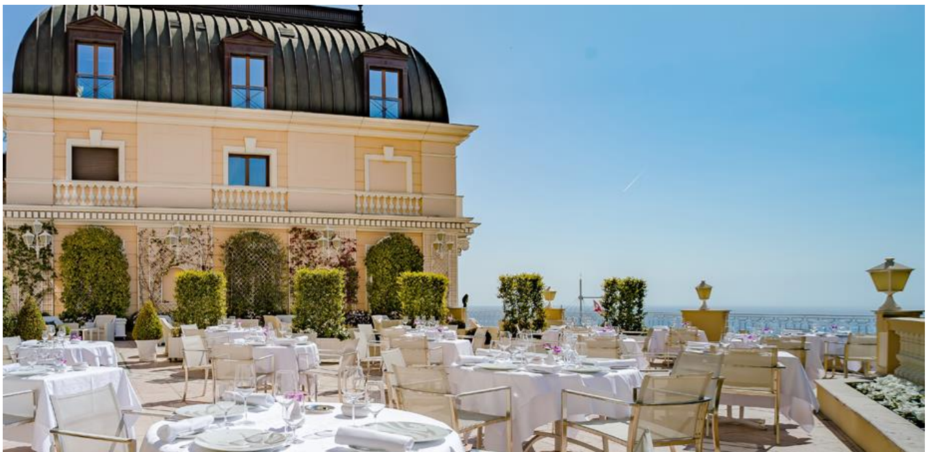
Overnight 5 Star Monte Carlo Beach Hotel

In the afternoon, you will have an opportunity to an exclusive tour the official residence of the Prince of Monaco, which has been home to the ruling family of Monaco for more than 700 years! After seeing this impressive palace, you will dine at one of Monaco's Michelin rated restaurants.